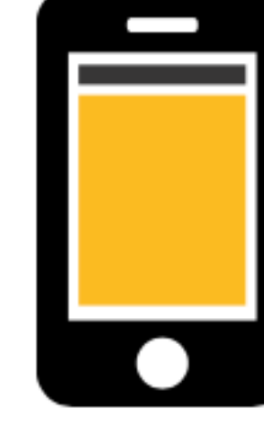
Half Page ad