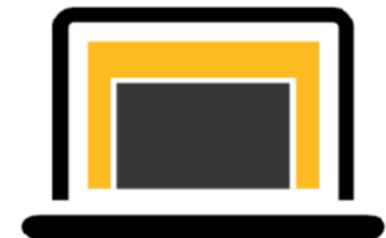
Skin + Billboard