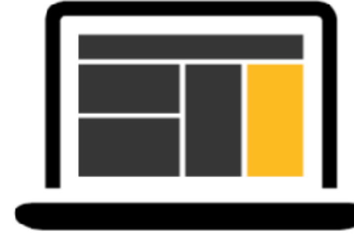
Half Page ad